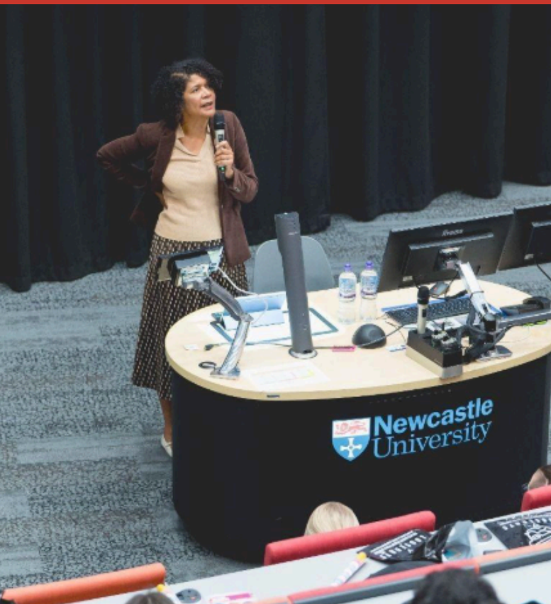
Welcoming Newcastle University's international students.