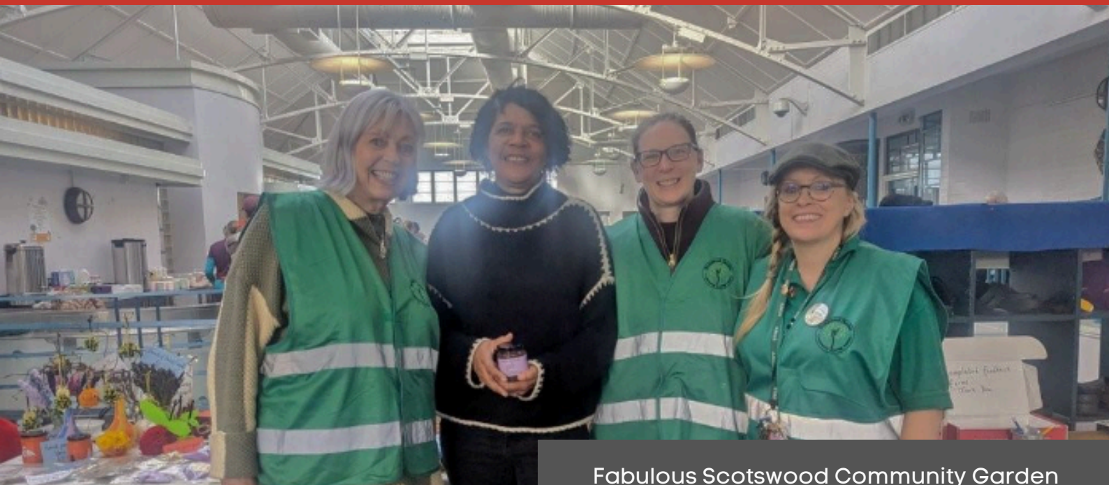
Fabulous Scotswood Community Garden Apple Day!

Rewiring the Revolution: What's Next for Responsible AI Innovation in Britain (New Statesman); Next-Gen Government: Data & AI in Public Service; New Statesman and Cohere – How Can AI Adoption Across Sectors Create Opportunity and Invigorate National Growth?; Business Returns in the Age of AI; How to Ensure the UK Is the Most AI-Aware Government in the World with Infosys; A True Digital Democracy: How Do Government, Business and the Third Sector Work Together to Connect the Digitally Excluded?; Tech Hub Leaders Speech Reflections Panel; The Entrepreneurial University: Rethinking What Higher Education Means; and Civic Health Innovation Labs – Data and AI for All: Building a Stronger Health and Social Care System; how the UK can accelerate AI adoption in SMEs and the future of online safety: tackling deepfakes, misinformation and fraud roundtable.