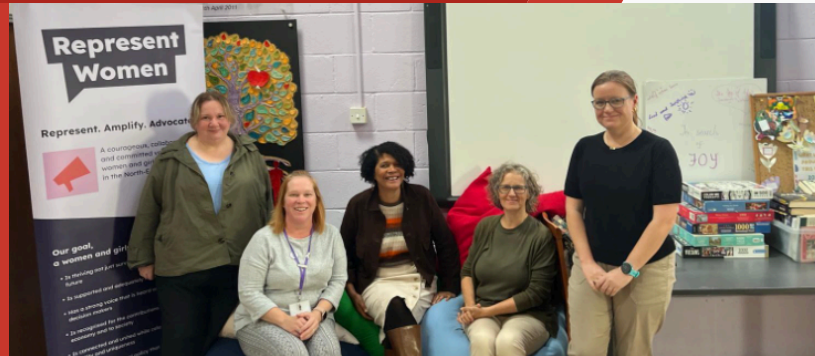
Talking about issues affecting women and girls with Represent Women.

Bus Services: Newcastle upon Tyne 10 September, Parking: Pedestrian Areas 10 September, Social Security Benefits: Children 1/2 10 September, Social Security Benefits: Children 2/2 10 September