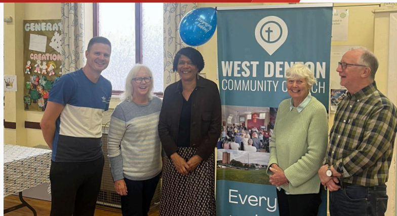
A warm welcome at West Denton Community Church's Café Connect.