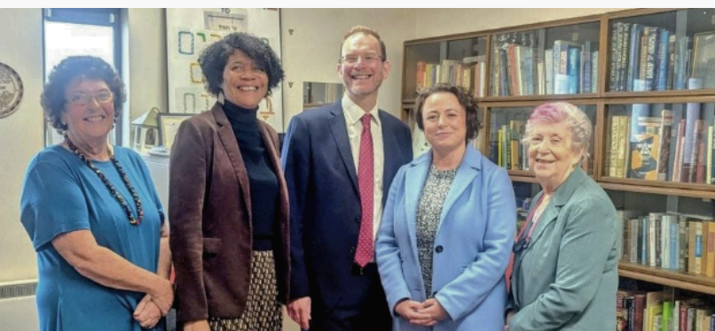
Privileged to attend Newcastle Reform Synagogue for Shabbat.

My visits to the Centre for Life's Mitochondrial Lab, Marie Curie Hospice, and Aelius Biotech highlighted Newcastle's leadership in science, care and innovation, changing lives and creating opportunities on our doorstep.