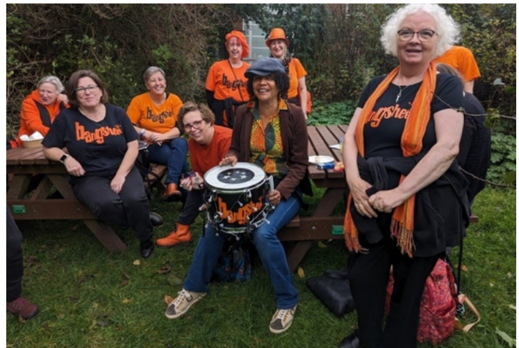
Brilliant fun at Scotswood Garden

High Speed 2 Line: Cost Effectiveness 26 October 2023 STEM Subjects: Ethnic Groups and Girls 26 October 2023 AI Council and Frontier AI Taskforce 26 October 2023 Space Technology: North East 25 October 2023 Nuclear Power 25 October 2023 Nuclear Fusion: Research and Training 25 October 2023 Science: Expenditure 25 October 2023 Local Press 24 October 2023 Digital Economy Council 24 October 2023 STEM Subjects: Higher Education 24 October 2023 Bus Services: Newcastle upon Tyne 24 October 2023 Voluntary Scheme for Branded Medicines Pricing and Access 24 October 2023 Companies: Horizon 2020 24 October 2023 Companies: Horizon Europe 24 October 2023 Business: Research 24 October 2023 Business: Research 24 October 2023 UK Health Security Agency: Research 23 October 2023 Broadband: Finance 20 October 2023 Databases: Water 20 October 2023 National Space Council 19 October 2023 Companies: Horizon Europe 19 October 2023 UK Research and Innovation: Finance 19 October 2023 Horizon Europe 19 October 2023 Business: Research 19 October 2023 Universal Credit 17 October 2023 First Time Buyers: North East 17 October 2023 National Tutoring Programme: Finance 17 October 2023 Pupil Premium 17