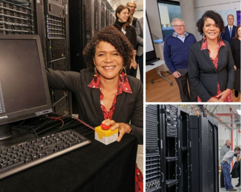
Launching the new £10m COSMA 8 supercomputer at Durham University which has the power & memory of 17,000 home PCs