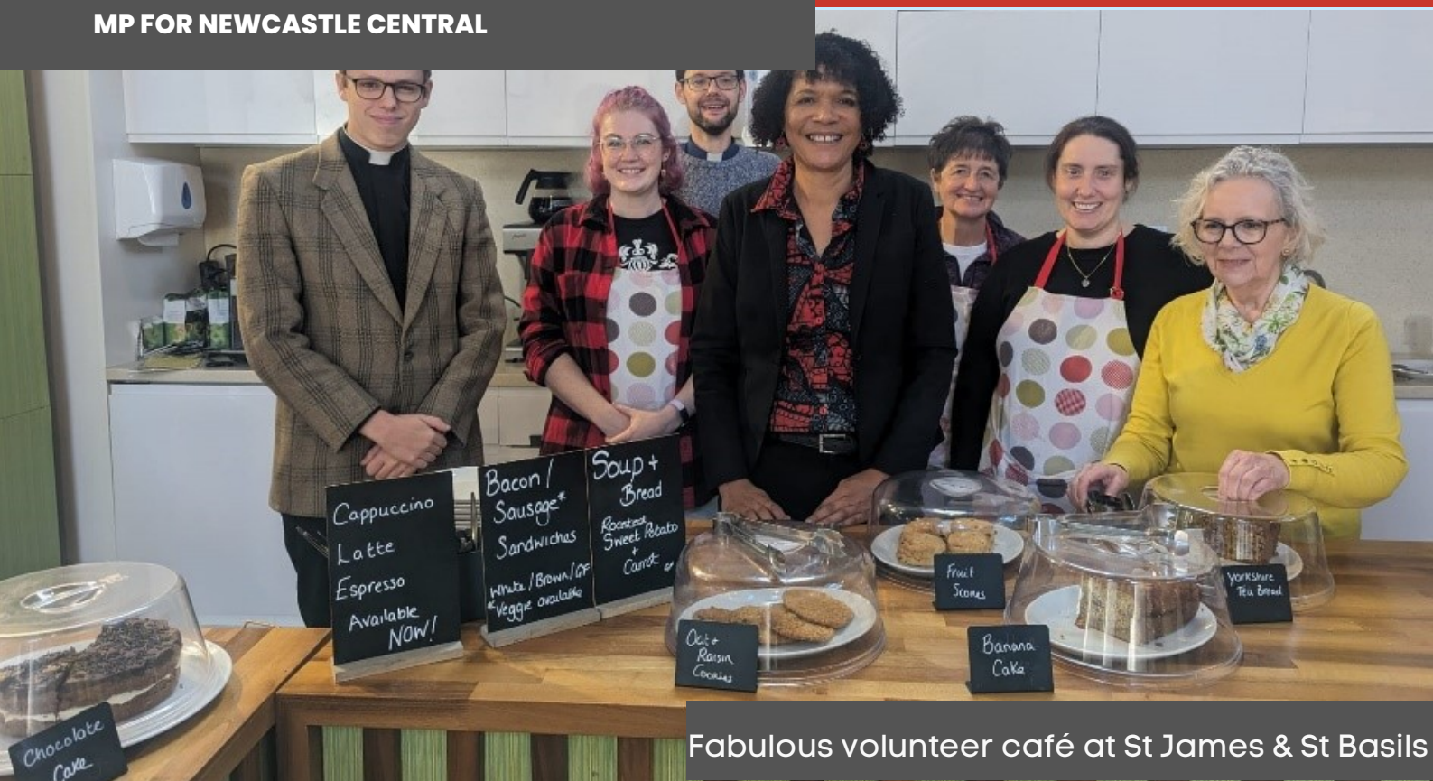
Fabulous volunteer café at St James & St Basils