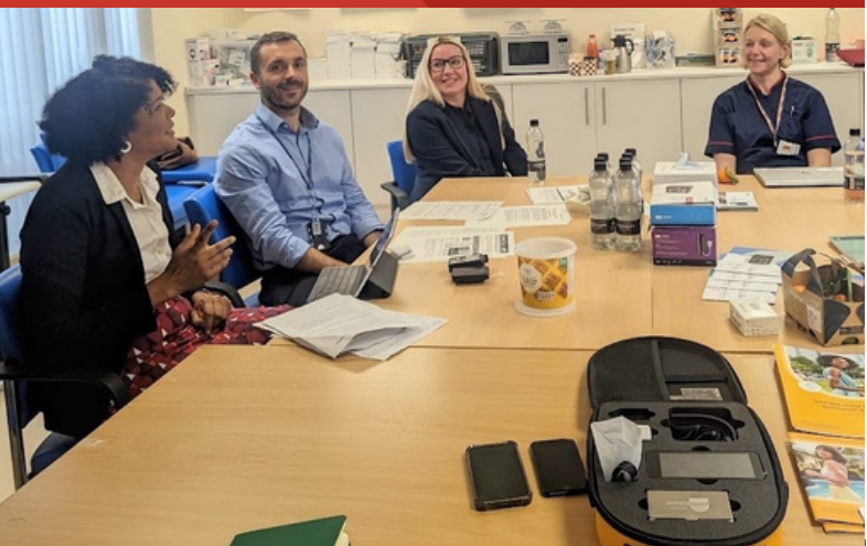
Informative time at Newcastle Diabetes Centre