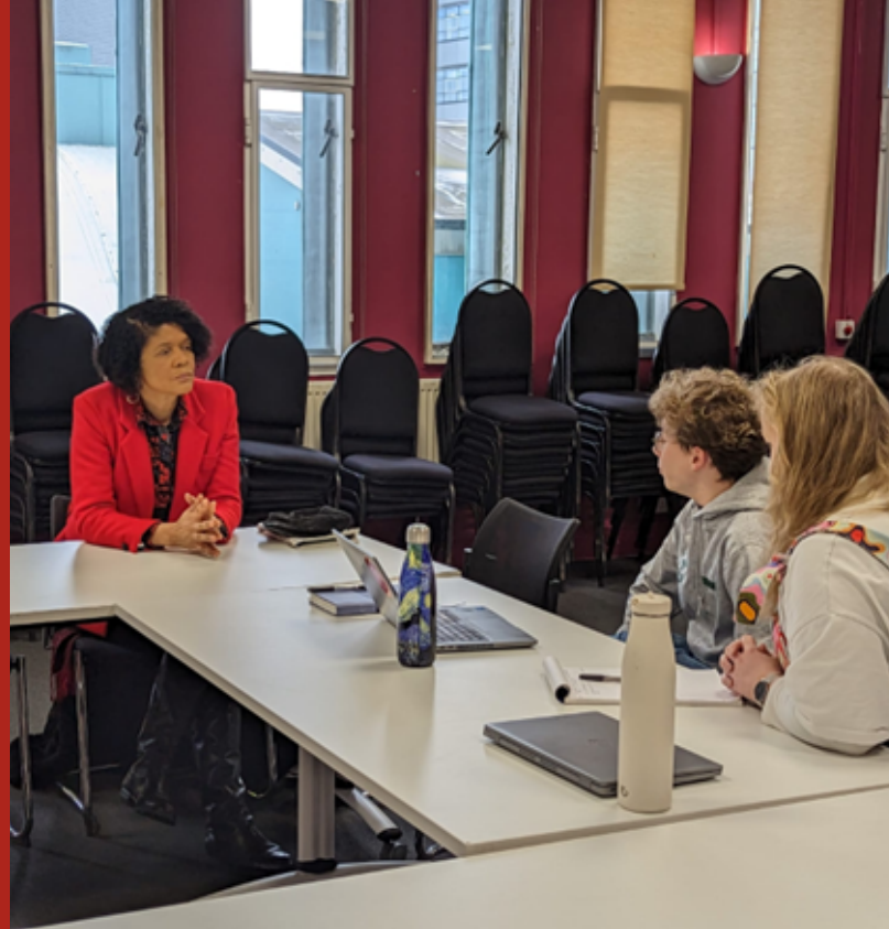
Meeting with Mady and Mack from Newcastle Students' Union to discuss the cost of living

I continue to engage with the Prime Minister, Ministers, Government Agencies and others regarding local bus services, the ongoing situation in Iran and Iranian regime supporters in the UK, cuts to local BBC services, pay disputes in the NHS workforce, and the situation regarding the Strawberry Place development.