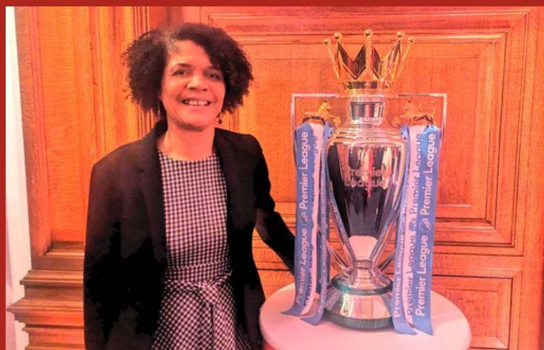
Hopefully the ribbons will be black and white soon! With the Premier League at Labour's Trade Reception