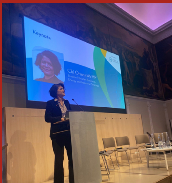
Speaking at the BVCA Emerging Technology Conference